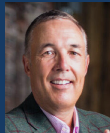
Art Dodge ECORE INTERNATIONAL