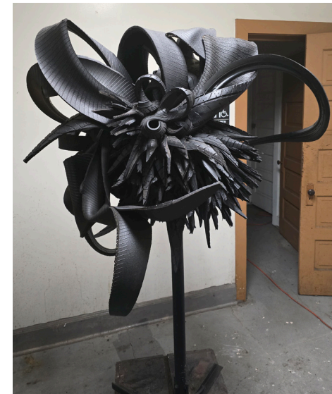
Works on display at the conference.