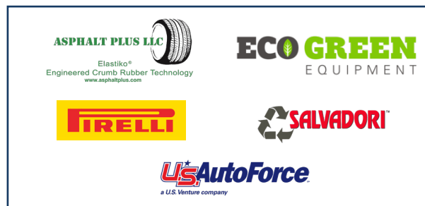
EXHIBIT HALL INFORMATION

The Exhibit Hall is the heart of the conference experience, where attendees connect directly with the companies and innovations driving our industry forward. We are proud to welcome 30 exhibitors to the 10th Tire Recycling Conference, representing the equipment manufacturers, service providers, and solution leaders shaping our industry's future. Their presence offers attendees an invaluable opportunity to build lasting partnerships and discover the tools moving end-of-life tire management toward a fully circular system.