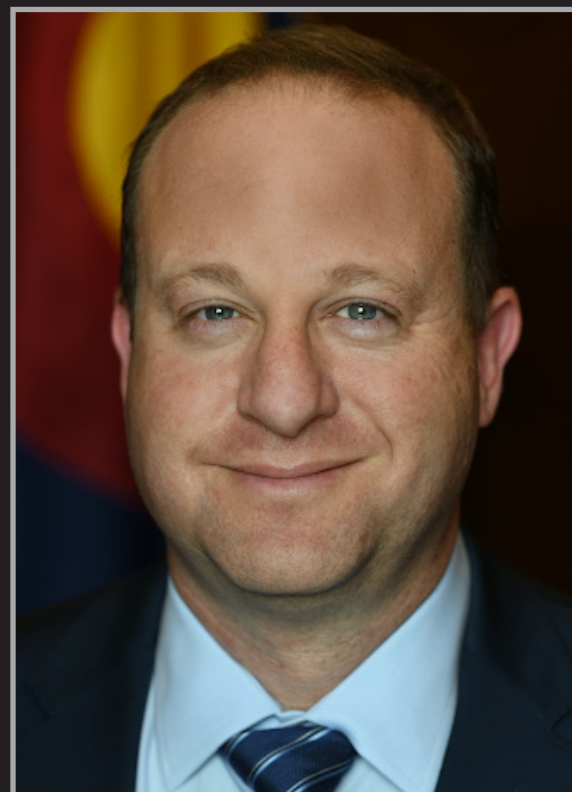
Governor Jared Polis

Governor Jared Polis is an entrepreneur, business leader, and dedicated public servant. Under his leadership, Colorado has become a national leader in clean energy and sustainability, advancing innovations that protect our environment while helping save people money. Governor Polis remains focused on building an affordable, sustainable, and livable Colorado – now and for generations to come.